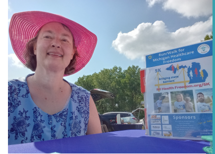
At the Cass Co Fair and local Farmer's markets

One experienced staffer told me health policy had nothing going on. I gently told him, "Health policy always has something going on," and shared my concerns on current issues - a younger staffer in the background nodding emphatically the whole time.