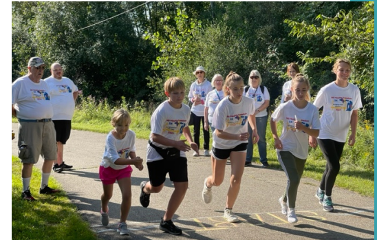
The 2023 MHF 5K