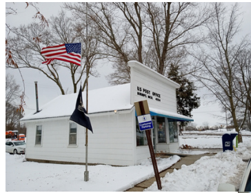
Mail intake at the Burnips Post Office