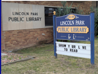
Library Tours: 3