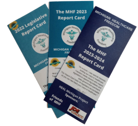
Big Mailings: 2