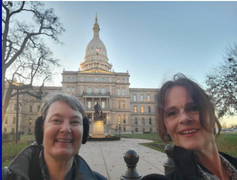
Lansing Days: 3